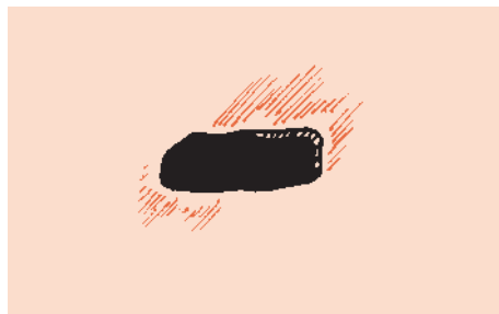
A pipistrelle bat entrance hole needs to be no bigger than this

Although droppings are the most certain identification feature, other occasional clues to the presence of bats may include a characteristic