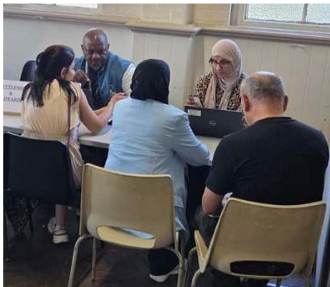
The Sanctuary Eastbourne